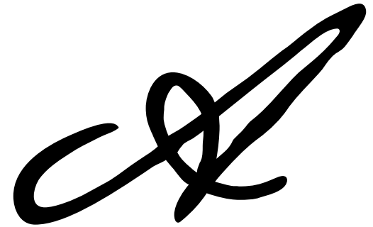
Old-fashioned 19th century script