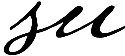
Handwritten connected script