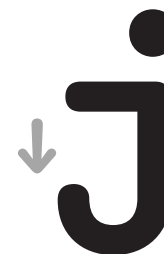
Short "j" descender